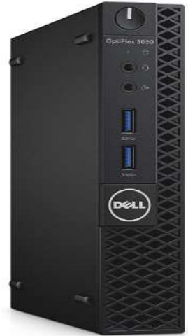
DELL PC hardware included