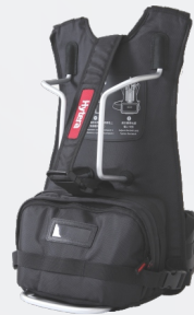
Nylon Backpack (for portable repeater only)(black) NCN010