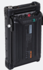
Power Management System PV3001