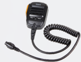
Waterproof Remote Speaker Microphone ( IP67 ) SM18A1

Optional antenna designed by Hytera is highly recommended. *Outdoor use of RD96X with antenna should avoid thunderstorms.