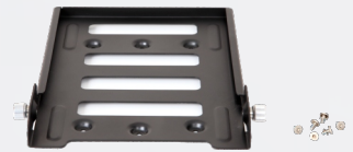
Multi-Functional Installation Bracket BRK17

Optional antenna designed by Hytera is highly recommended. *Outdoor use of RD96X with antenna should avoid thunderstorms.