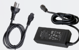
Power Adapter for Portable Repeater PS7502